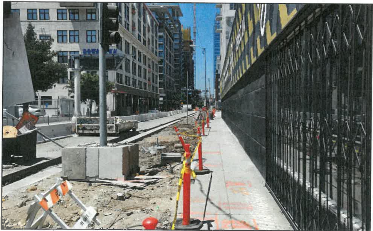
8. Condition of abutting sidewalk on 11 th St., facing northwest.