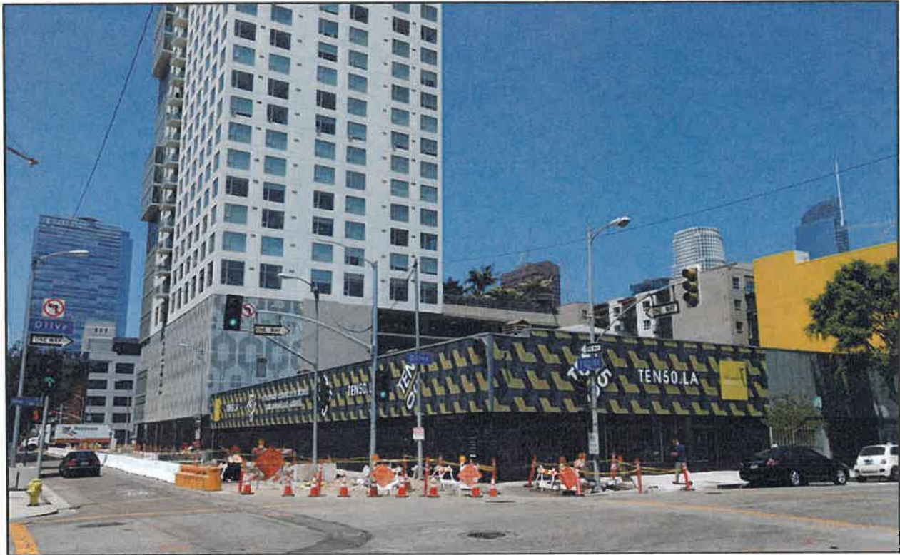
1. Subject Site, facing north on Olive St. and 11 th St.