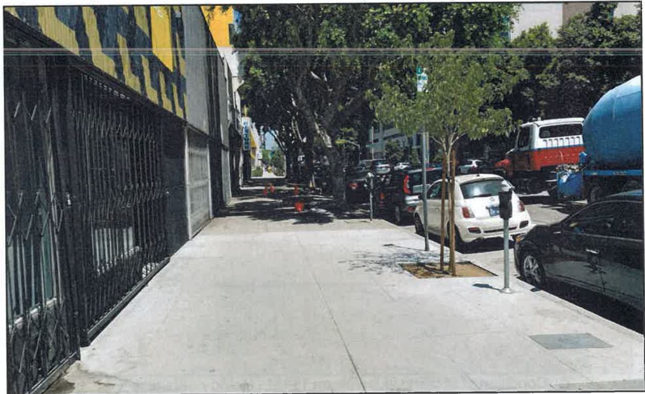
10. Condition of abutting sidewalk on Olive St., facing northeast.