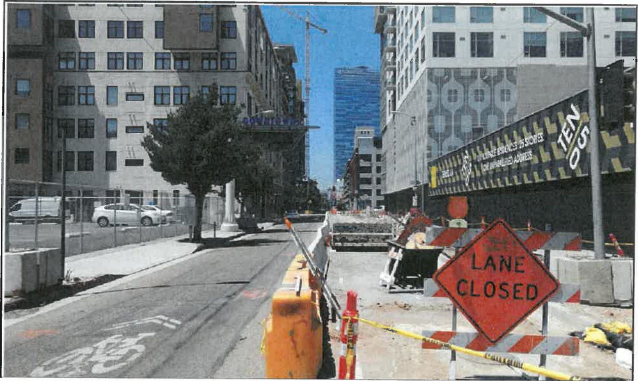
7. Condition of public right-of-way - 11 th St., facing northwest.