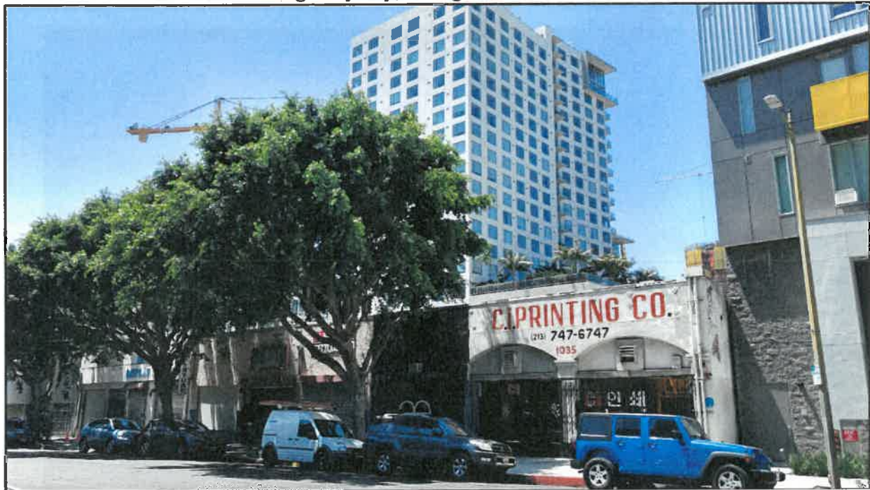
12 Subject site, facing west on Olive St.