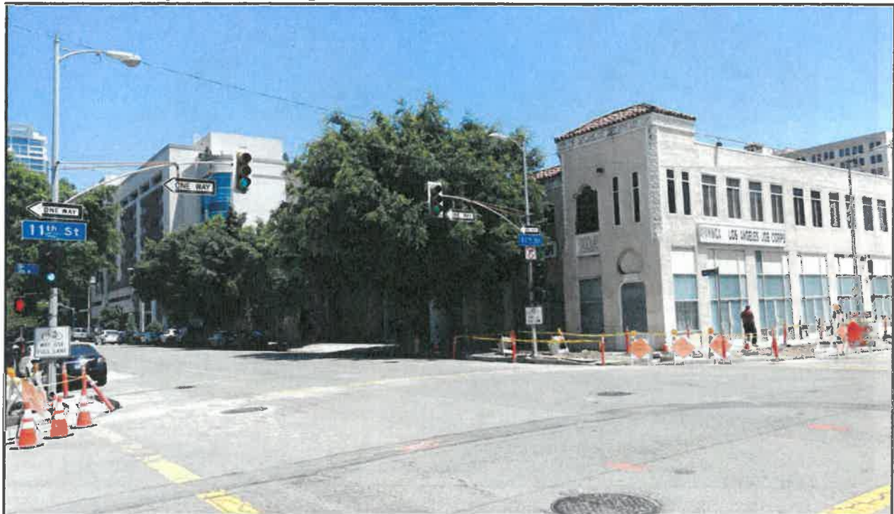
4. Neighboring commercial buildings on Olive Street across from Subject Site, facing east.