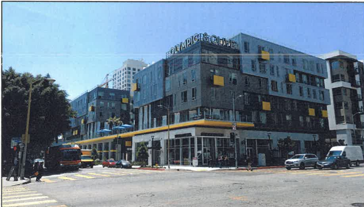
14. Abutting Olympic & Olive building, facing west on Olive St. and Olympic Blvd.