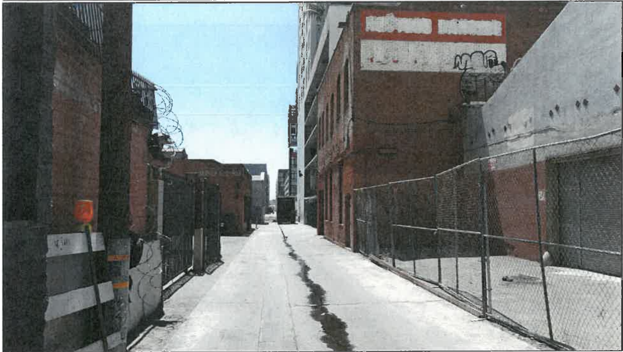
11. Condition of abutting alleyway, facing southwest.

Site Address: 1033-1057 S. Olive Street, Los Angeles, CA 90015