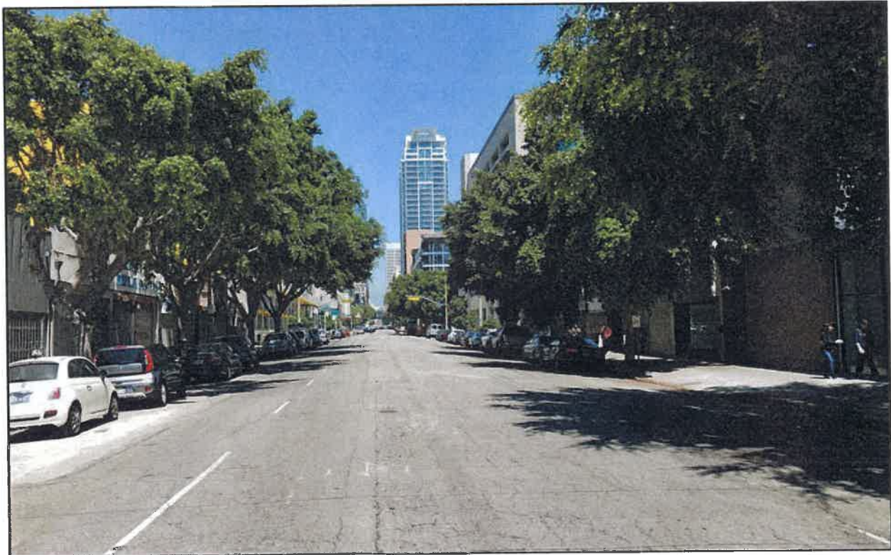
9. Condition of public right-of-way – Olive St., facing northeast.