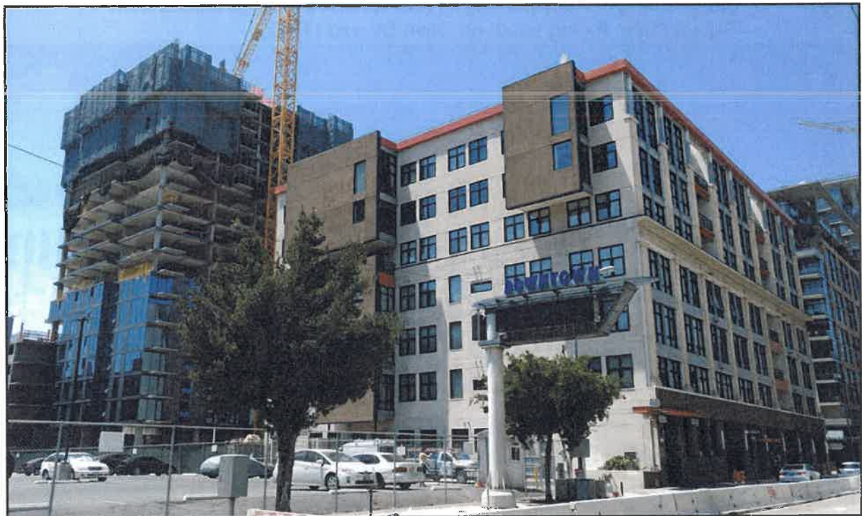
6. Neighboring mixed-use building, facing west on 11 th St.