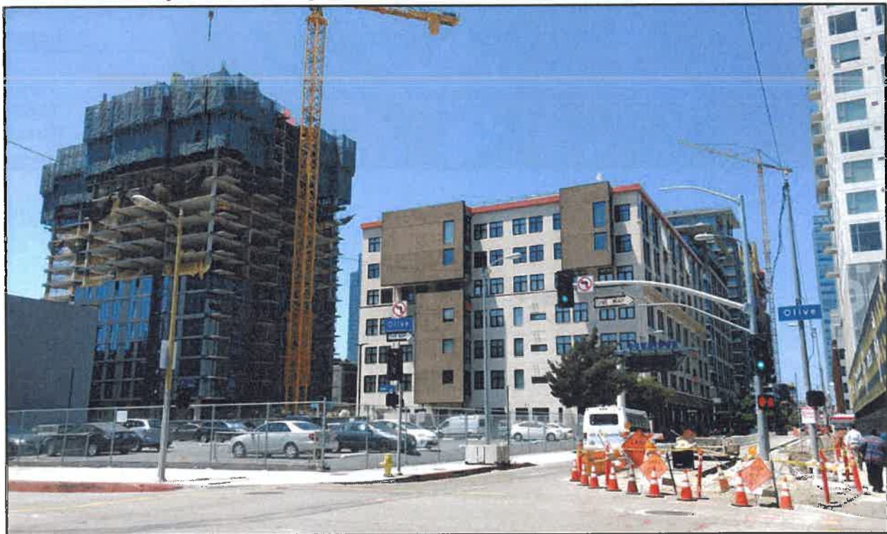
2. Neighboring surface parking lot and various buildings, facing west on Olive St.