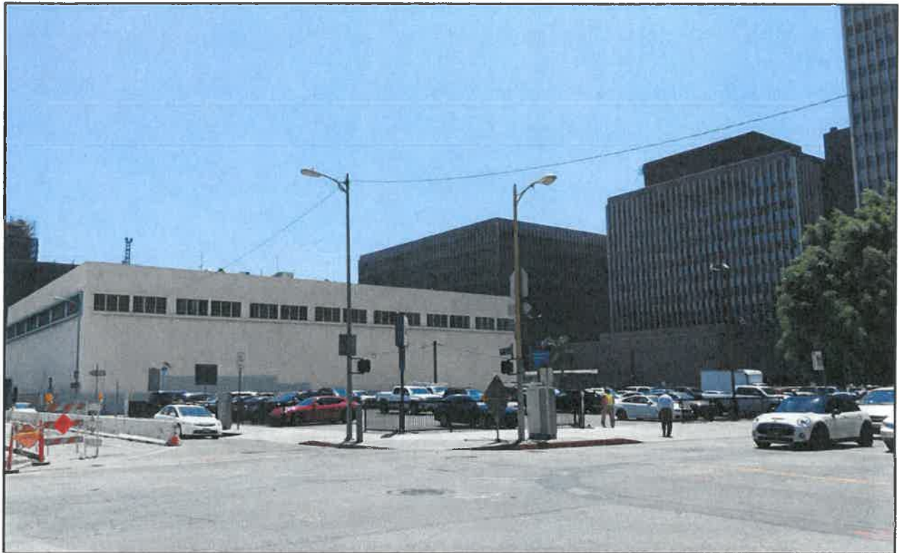
3. Neighboring surface parking lot and various buildings across from Subject Site, facing south on Olive St. and 11 th St.