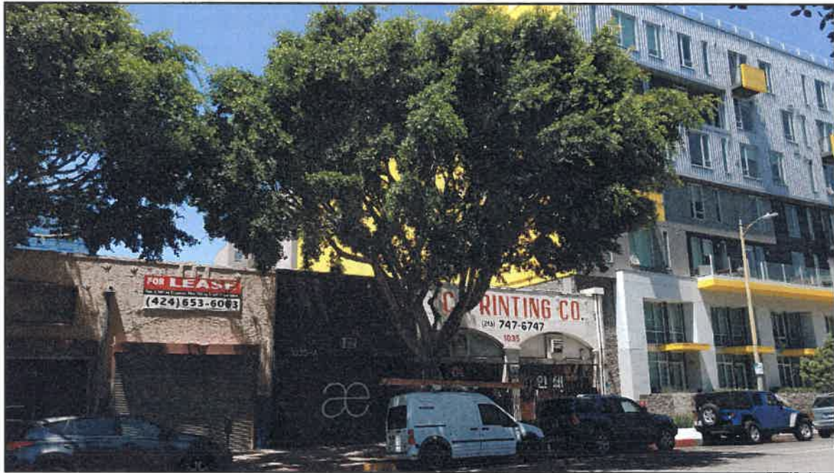
13. Subject site in relations Olympic & Olive building, facing northwest on Olive St.