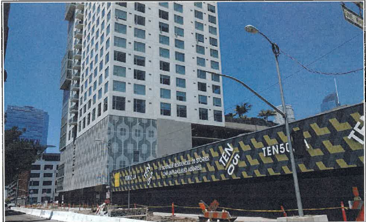
5. Abutting Ten50 building, facing north on 11 th Street.